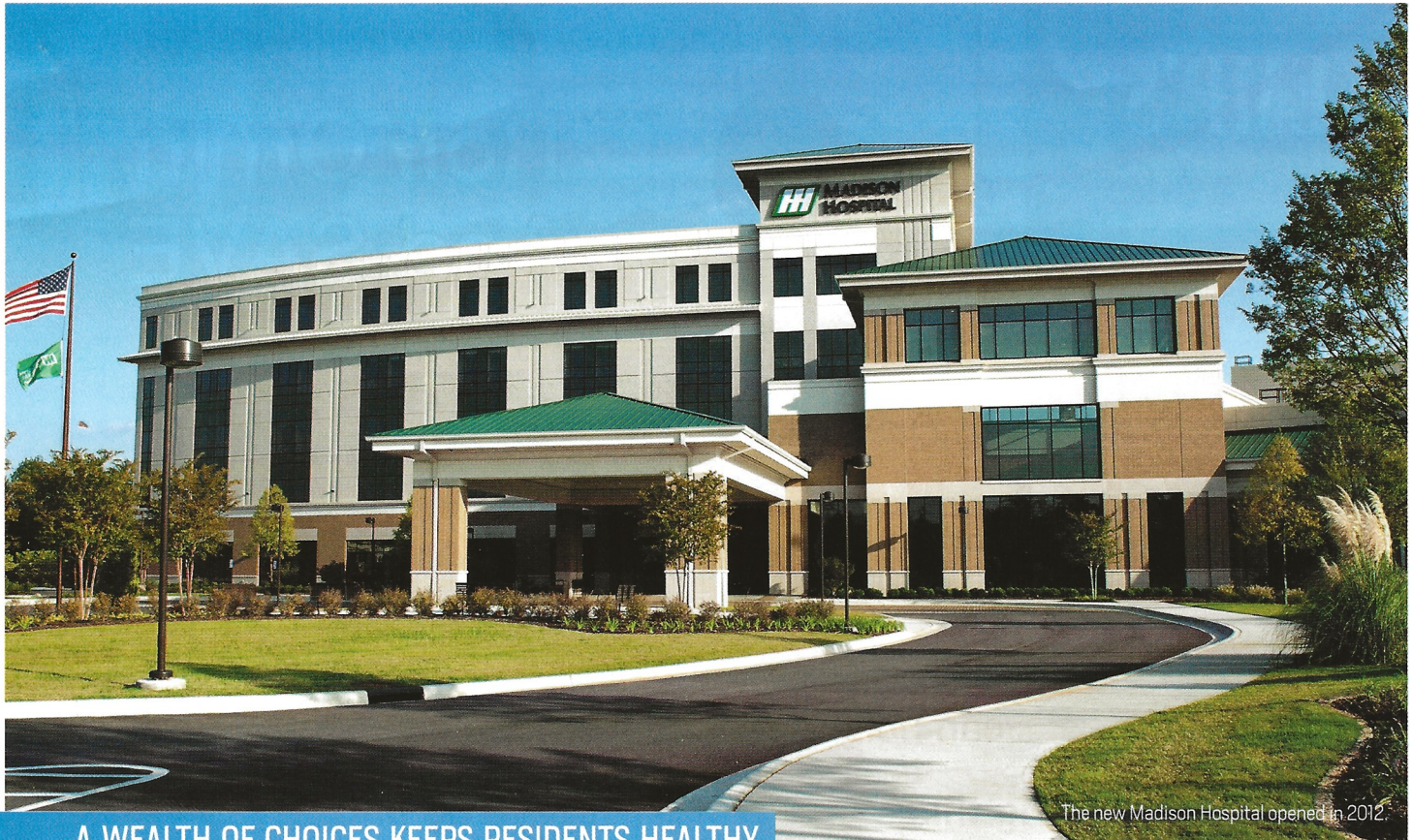
The new Madison Hospital opened in 2012.

A WEALTH OF CHOICES KEEPS RESIDENTS HEALTHY