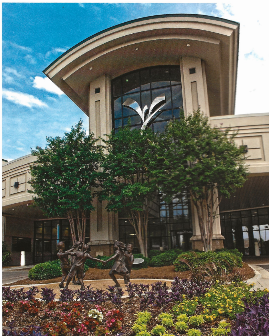
The Huntsville Hospital Center for Women & Children has delivered more babies than any other facility in the state.